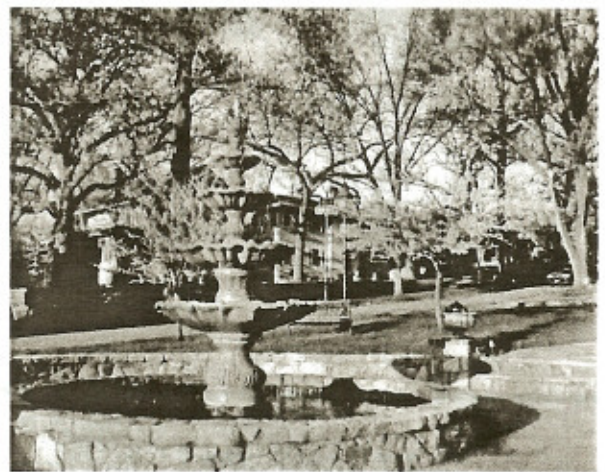
The island fountain and plantings at 50th and Ward Parkway create a distinctive entrance to Westwood Park.